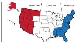
Sending Teams to compete at Zone Championships

The AO also hosted a year-end party with just a handful of attendees, where gift baskets were given to riders who contributed to our effort as a whole.